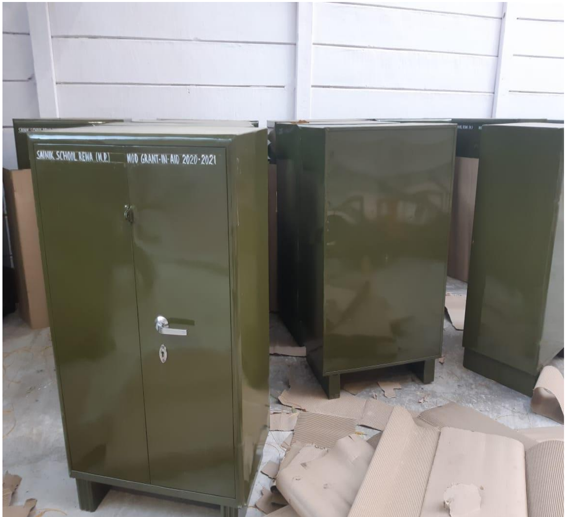
STEEL ALMIRAH 1155 mm 3 Shelves