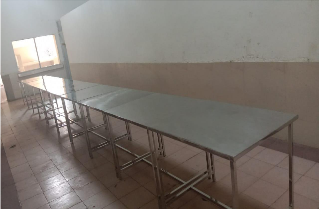
SS TABLE RECTANGLE

PROCUREMENT OF ITEMS THROUGH GEM PORTAL FOR ACADEMIC TRAINING AND ADMINISTRATIVE PURPOSE OF CADETS OUT OF MoD GRANT 2020-2021 Rs. 1 CRORE